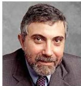
Paul Krugman

Should we use taxes to deter financial speculation? Yes, say top British officials, who oversee the City of London, one of the world's two great banking centers. Other European governments agree — and they're right.